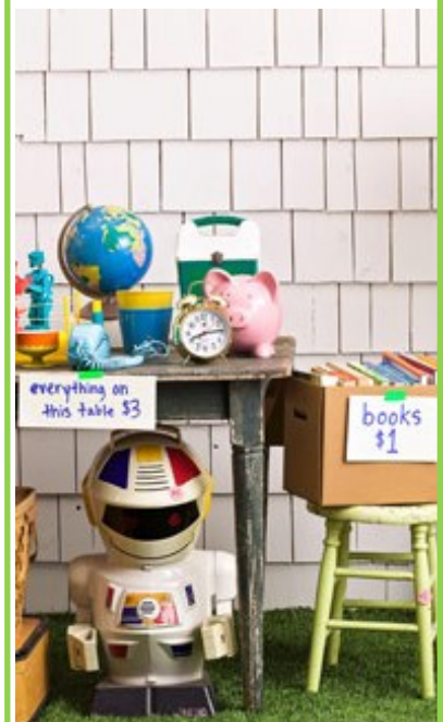
Clean out your closets and storage!

Is it Spring Cleaning Time at your house yet? Please hang on to your things a little while longer! The youth will be collecting those slightly used "treasures" for the upcoming Lions Garage Sale held on May 12-14. Collection dates will be May 10, 5:30-8:30pm and May 11, 4:30-8:30pm. Please drop donations at the East entrance of the Valley Creek campus. We ask that you have all clothing sorted, bagged and labeled in the following categories - men, boys, women, girls and infants. It helps tremendously - thanks! Sale proceeds support youth attending mission trips and NYG. If you have any questions call Shanna Salzman at 612-859-1365 .