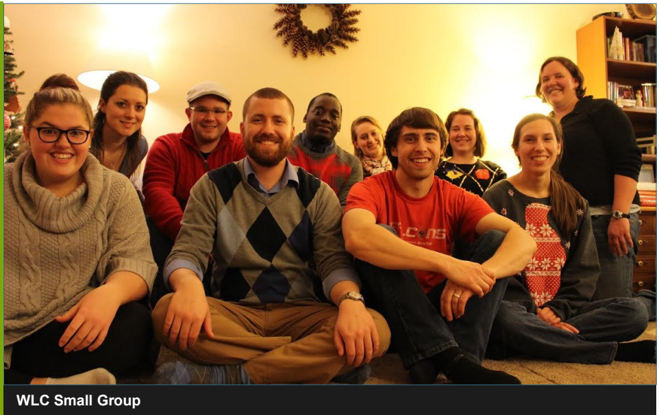
WLC Small Group