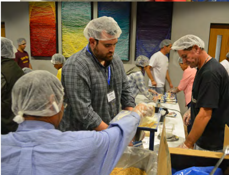
Greater FMSC MobilePacking event in September 2016 at the Valley Creek Campus of WLC